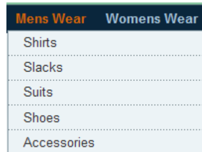
Figure 2: Top Nav = 2

Setting Maximal Depth to 0 displays all categories.